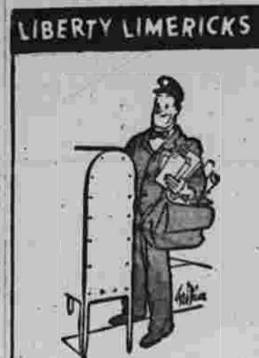
A postman who lived in New Haven...